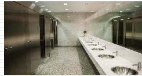
PARTITIONS: Restroom, School, Lockers