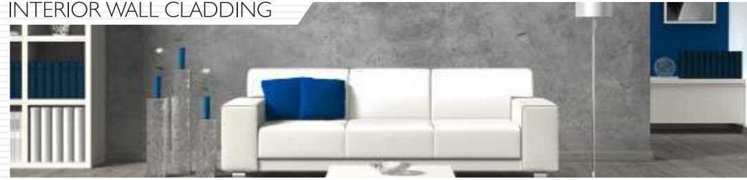
INTERIOR WALL CLADDING